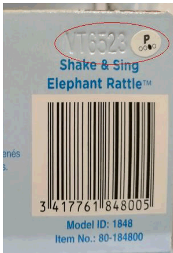
Image 2 Bottom of box with date code