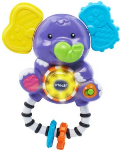
Image 1 VTech Shake & Sing Elephant Rattle