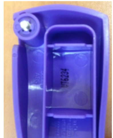
Product (inside battery cover)